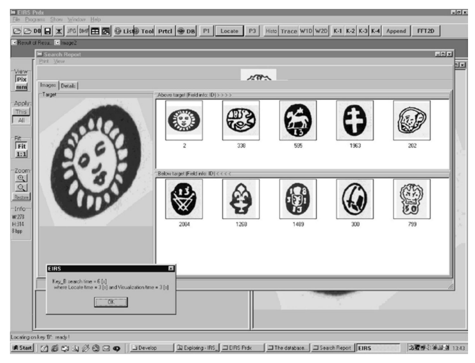
Fig. 3. EIRS: the image search engine.